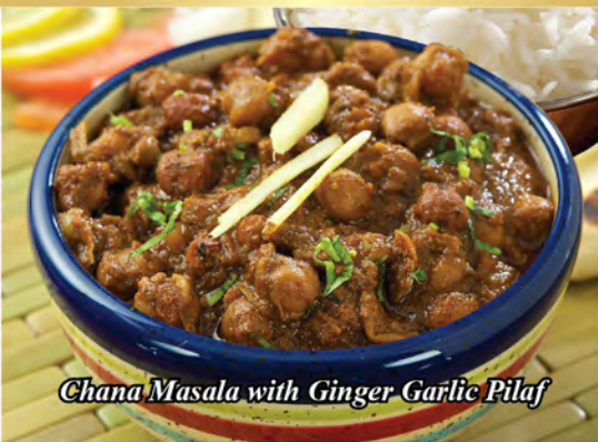
Chana Masala with Ginger Garlic Pilaf