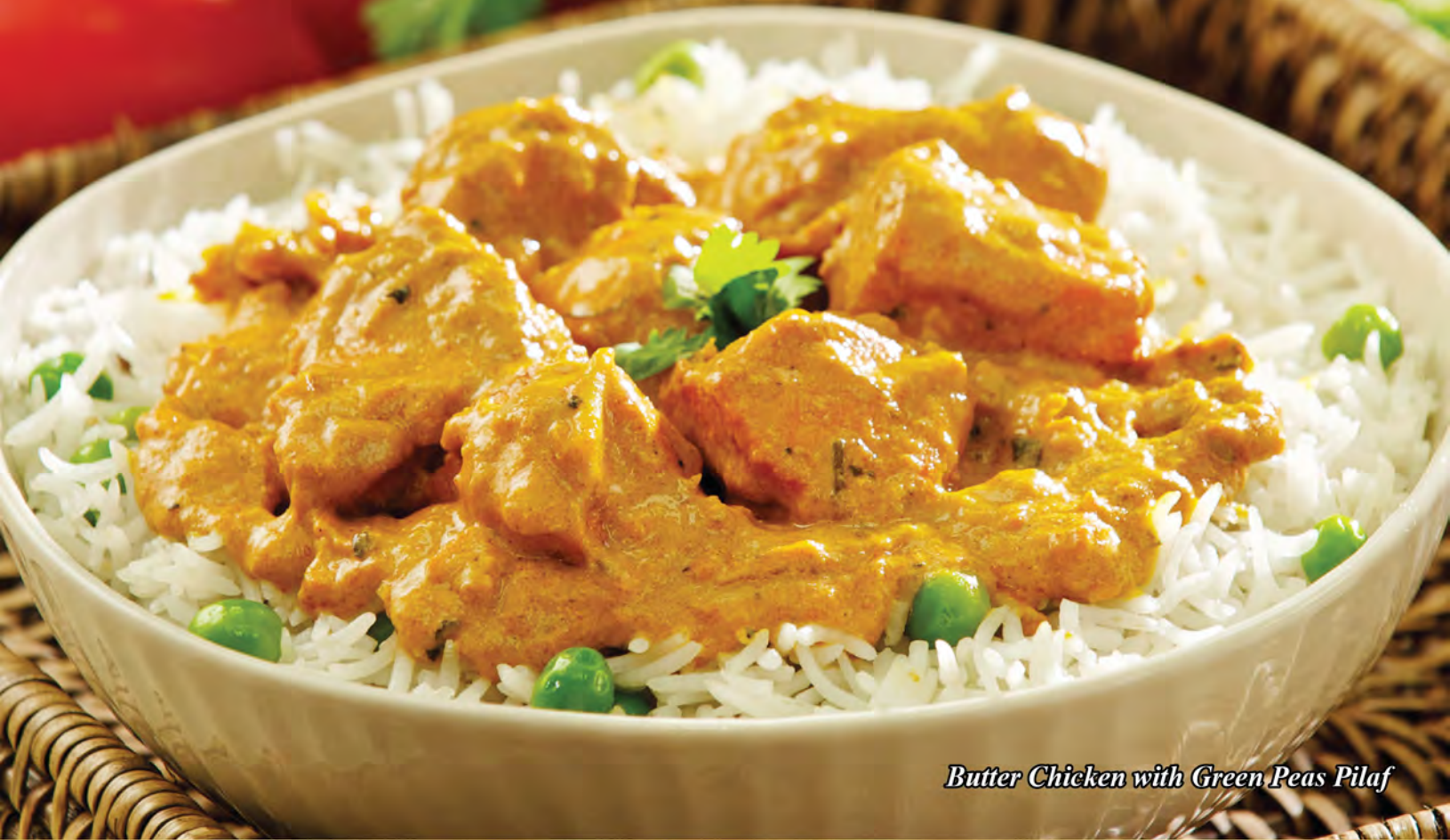
Butter Chicken with Green Peas Pilaf